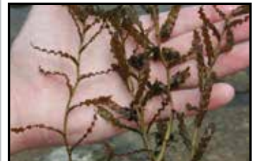
Curly Leaf Pondweed