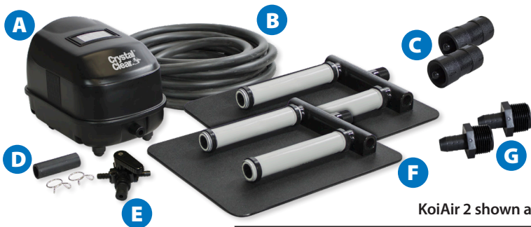
KoiAir 2 shown above.