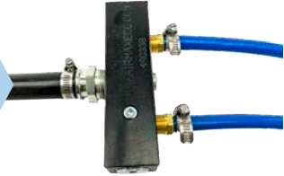
PS20 Installation Shown

Shallow Water Series® & PondSeries® & LakeSeries® Aeration Systems: Connect flex tubes from compressor to the brass barbs on the 3 : 1 manifold adapter, then connect 1" direct burial airline to the 1" barb fitting. If using with a SW20 or PS20 system, remove one of the brass barb fittings and install the 1/2" MPT plug provided. Removal of flex tube quick disconnects on SW systems will be necessary before connecting to the brass barbs.