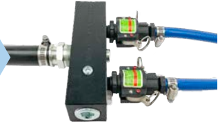
PS20 Installation Shown

Aeration Systems Using Camlock Connector Kit(s): Remove the brass barbs from the 3 : 1 manifold adapter and install 1/2" male camlock ends (sold separately). Install only two male camlock ends if using with an SW20 or PS20, and insert the galvanized plug into the remaining hole. Connect the flex tubes with female camlocks to the male camlock fittings on the 3 : 1 manifold adapter, then connect the 1" direct burial to the 1" barb fitting.